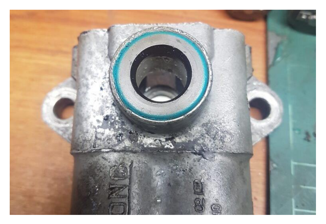
After carefully cleaning, reassembly was pretty simple. I used Motul 20W motorcycle fork oil.